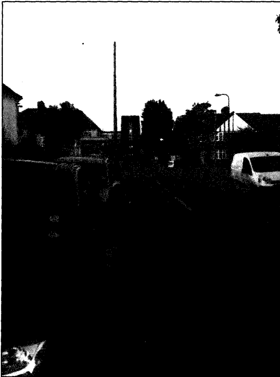
Image MW/02 shows the view of the school entrance taken from Chalfont Avenue