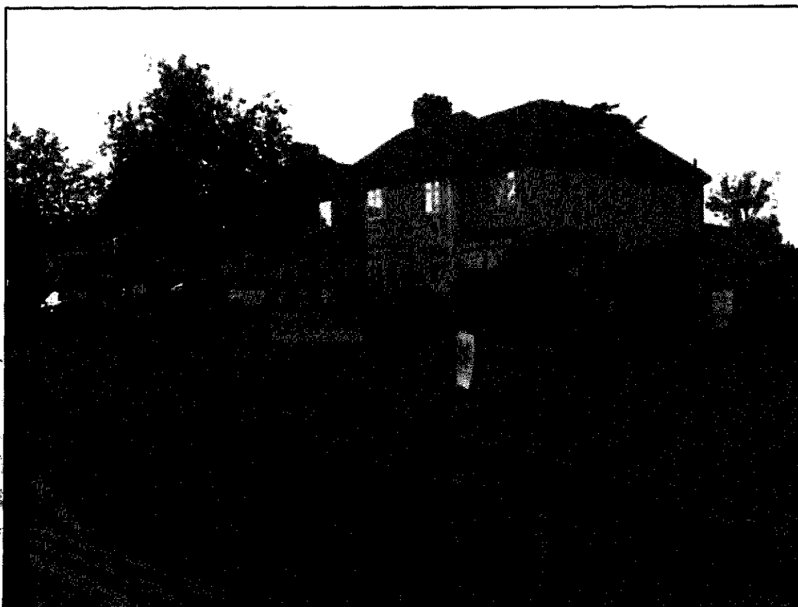
Image MW/03 shows the view of the school entrance looking partially along Oakington Manor Drive